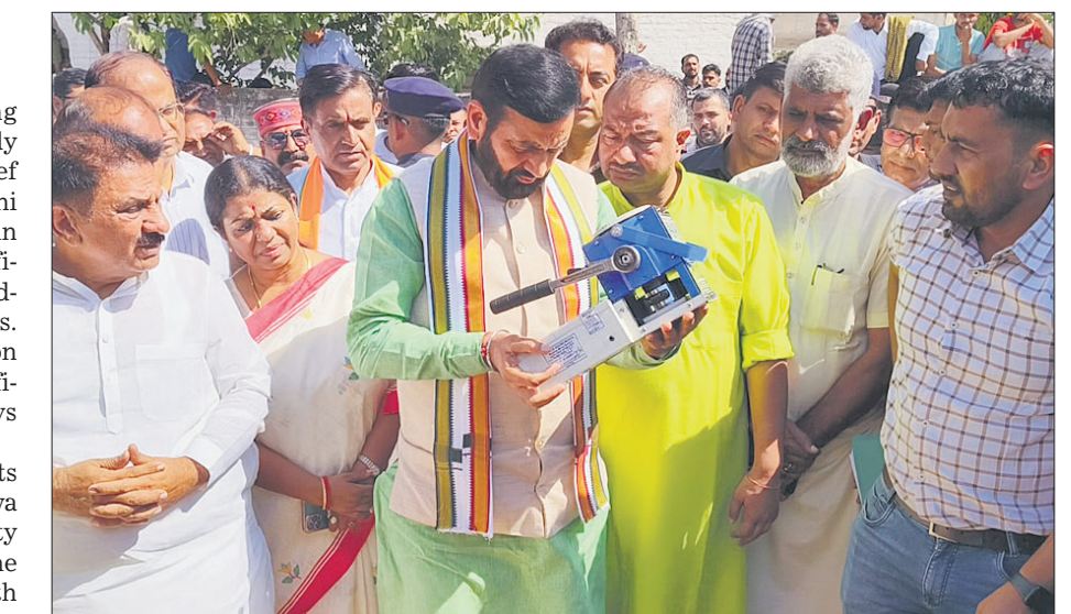
Caretaker CM Nayab Saini checks the moisture content of paddy at a grain market on Friday.

Farmers raised concerns firmly, saying: "No stock with 17 per cent or less about their produce lying in markets for five to eight moisture content should days and complained about remain unsold. The entire cuts imposed despite the crop must be purchased, moisture content being lifted, and payments below the required 17 per cleared on time. Action will cent. The CM responded